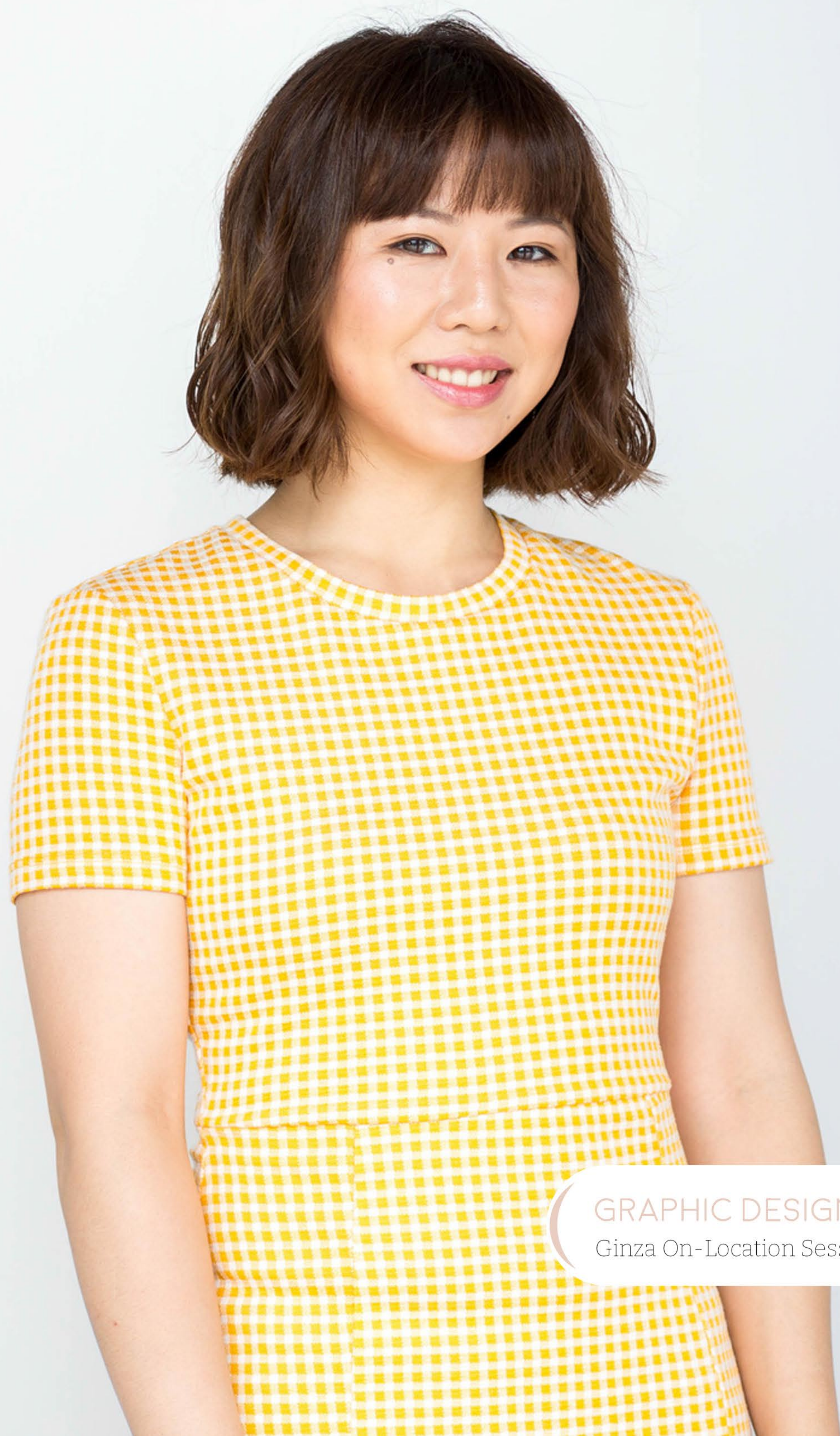
GRAPHIC DESIGNER Ginza On-Location Session