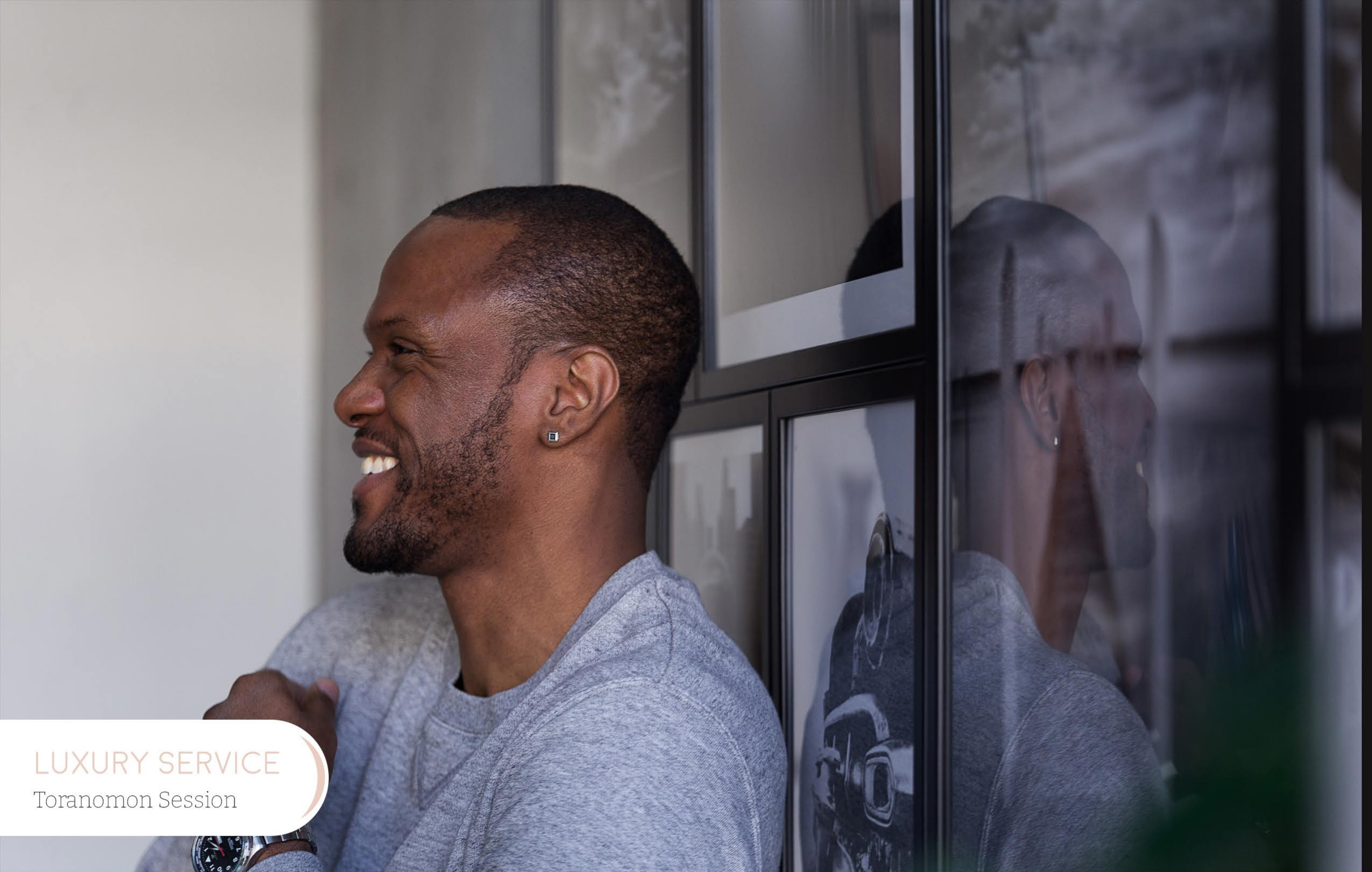
LUXURY SERVICE Toranomom Session