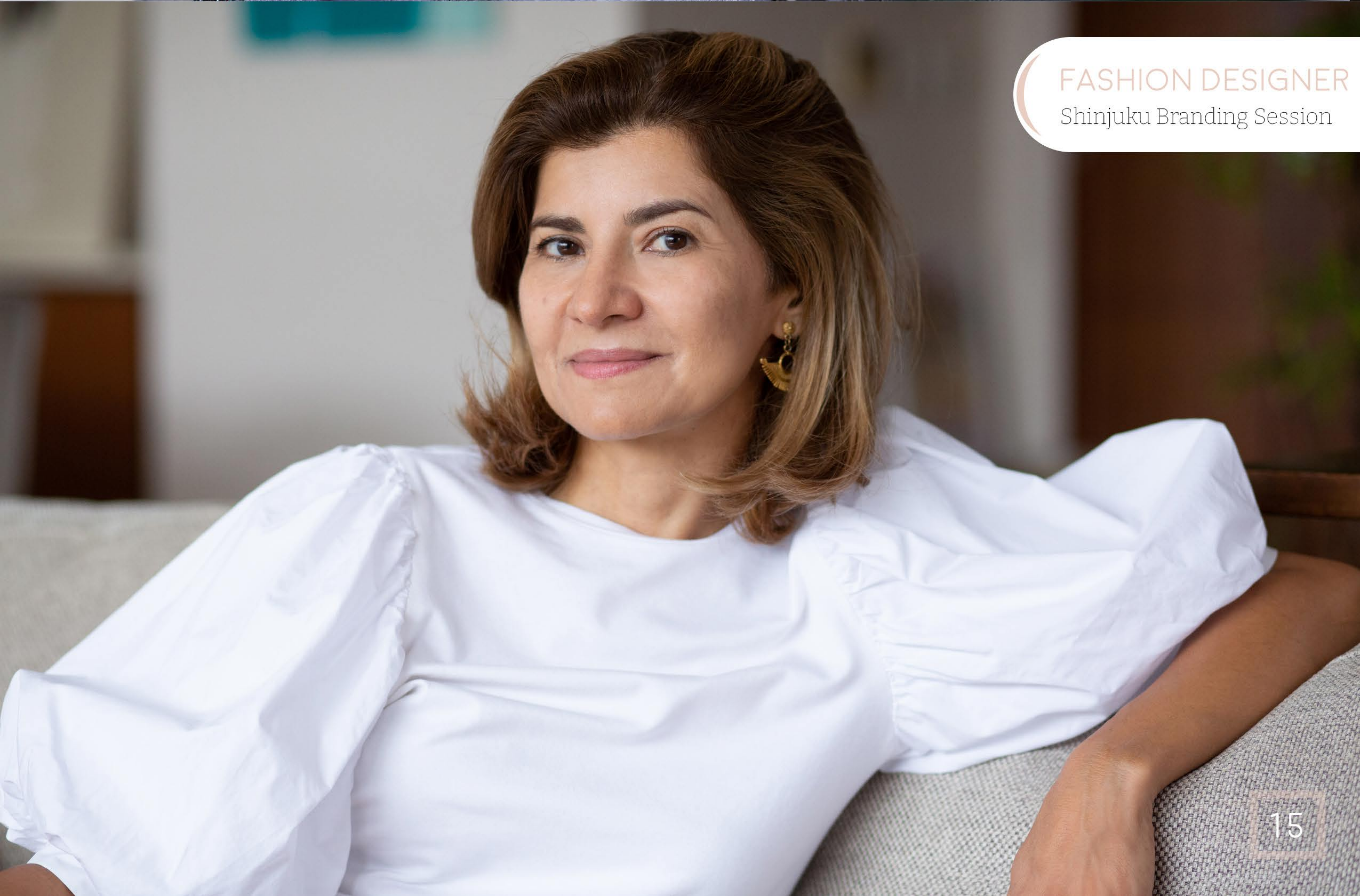
FASHION DESIGNER Shinjuku Branding Session